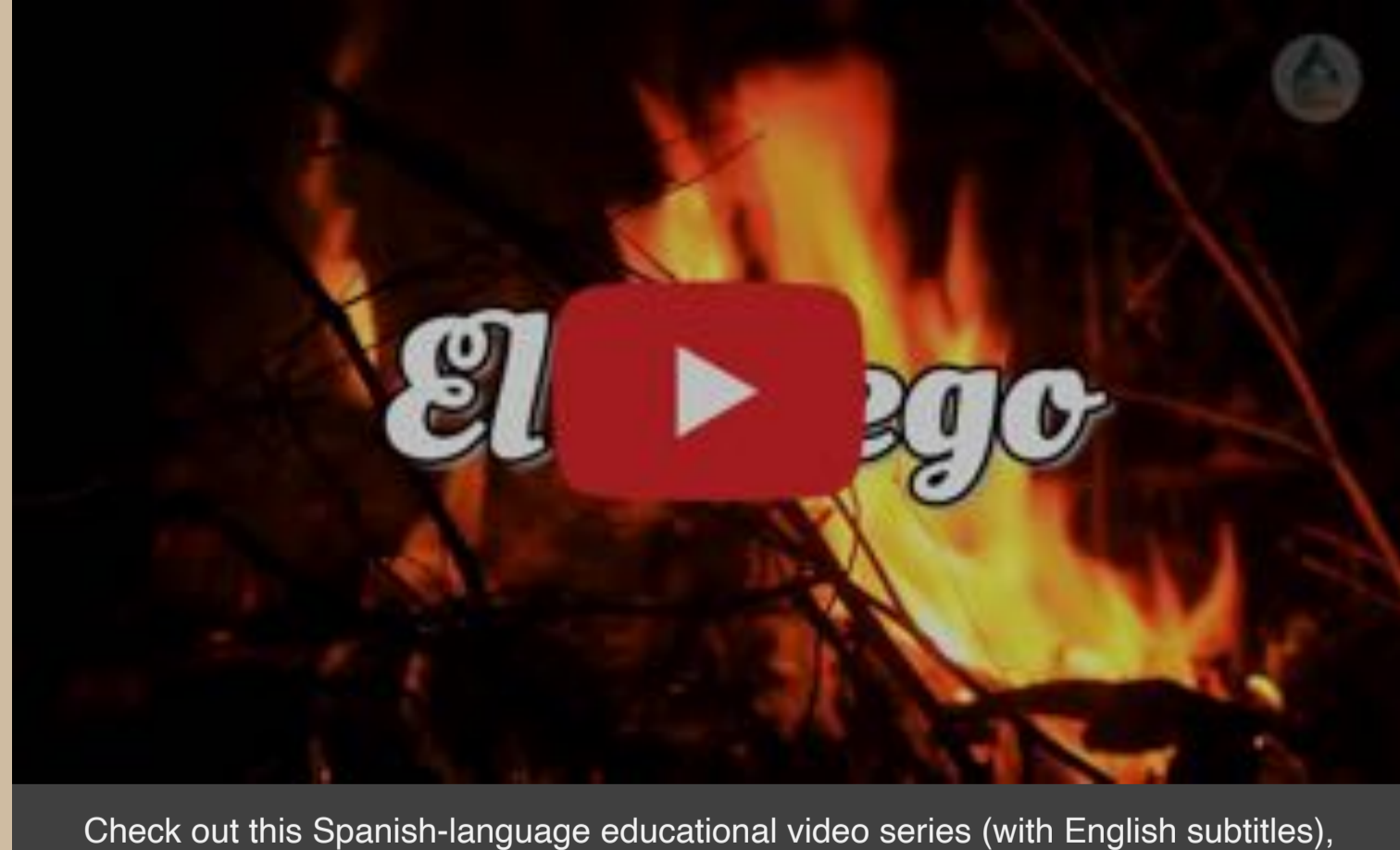
Check out this Spanish-language educational video series (with English subtitles), geared towards children living in areas with high fire risk.

Wildfire Matters (podcast) from the Bureau of Land Management – Explaining the National Interagency Fire Center