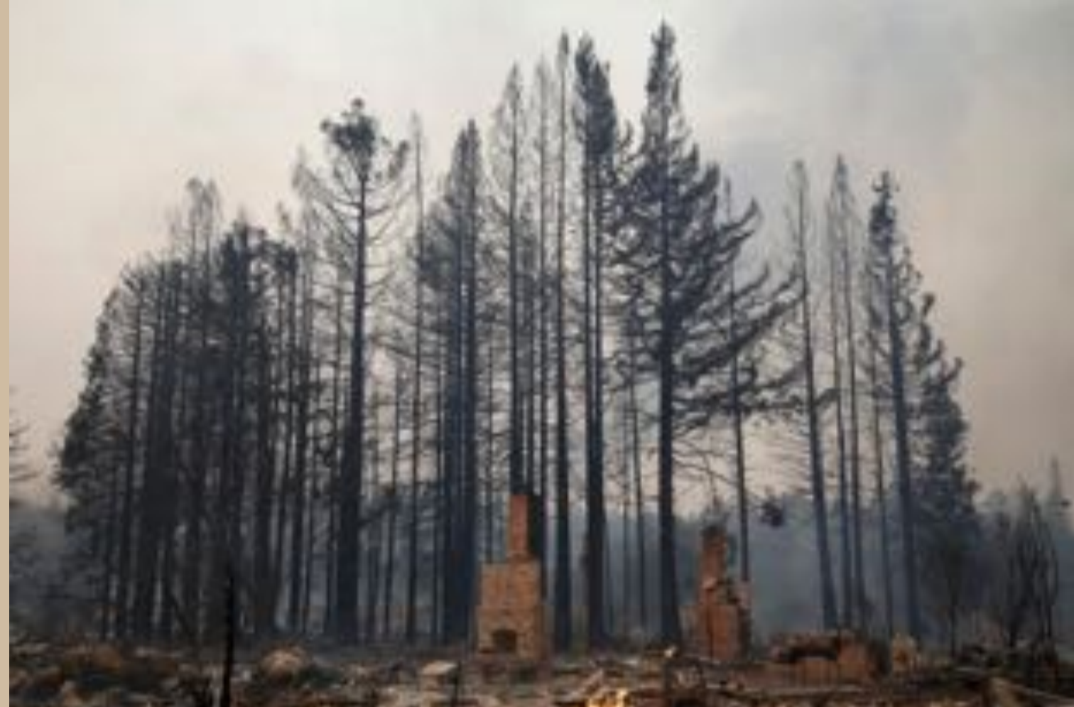
Structure losses during wildfires are largely attributed to embers and direct exposure from a flaming front. New Hazard Mitigation Methodology assesses effective structure, parcel, and community hardening strategies to mitigate structure losses.

As wildland-urban interface fires grow in number and severity, there is a growing need for comprehensive hazard assessment to harden structures effectively and cost-efficiently. The National Institute of Standards and Technology, CAL FIRE, and the insurance Institute for Business & Home Safety has created this Hazard Mitigation Methodology to explicitly address home and parcel retrofits that effectively mitigate fire risk. The Methodology was developed to inform retrofits to the current building stock, but can be applied to new construction in the WUI as well. "The structures destroyed by WUI fires have devastated entire communities and have cost billions of dollars while significantly impacting the social fabric and economic well-being of entire regions." Access the full report here.