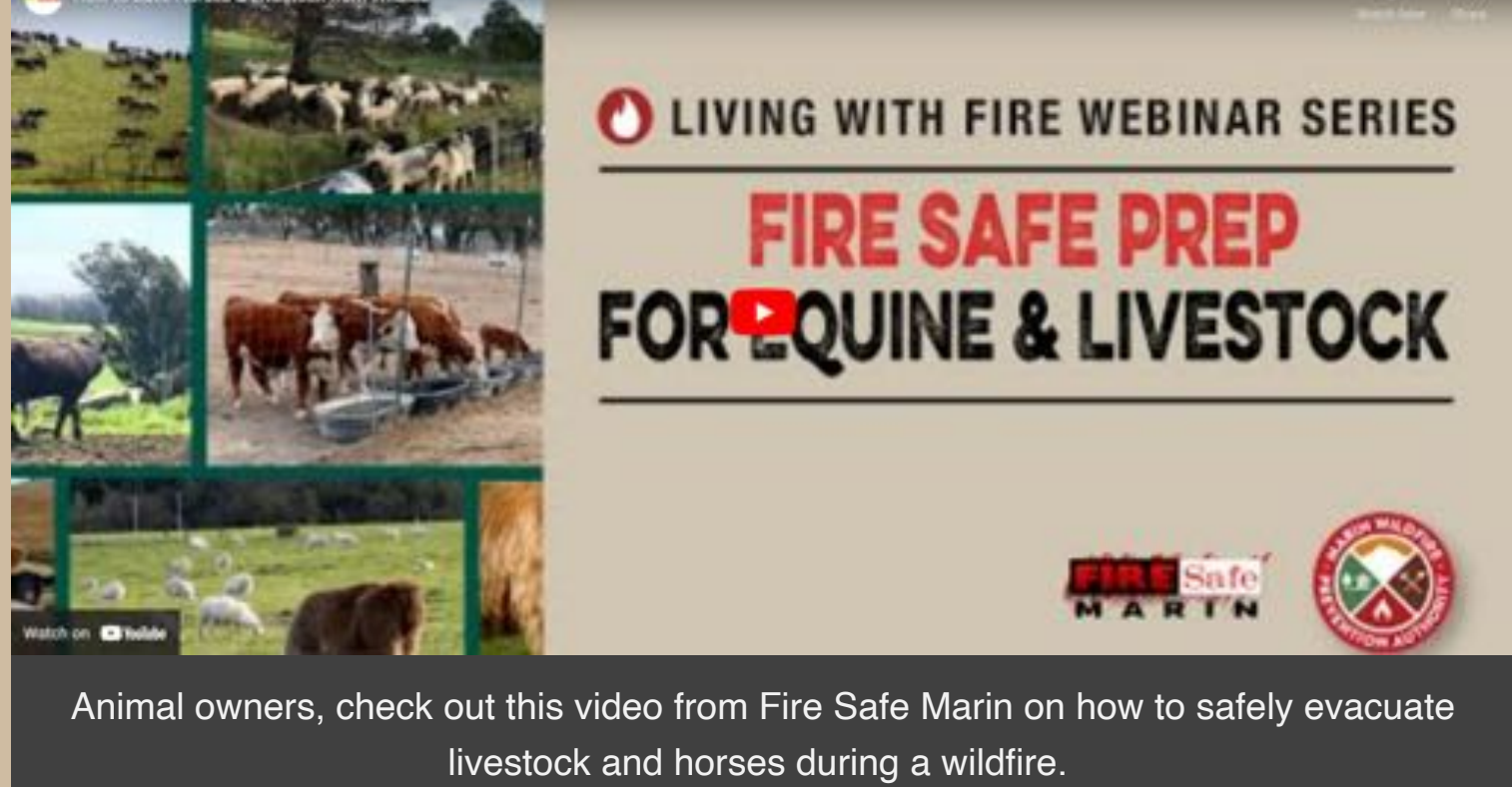
Animal owners, check out this video from Fire Safe Marin on how to safely evacuate livestock and horses during a wildfire.

Fire Ecology Chats (podcast) from the Association of Fire Ecology - Assessing the Role of Short-term Weather Forecasting in Fire Manager Tactical Decision Making