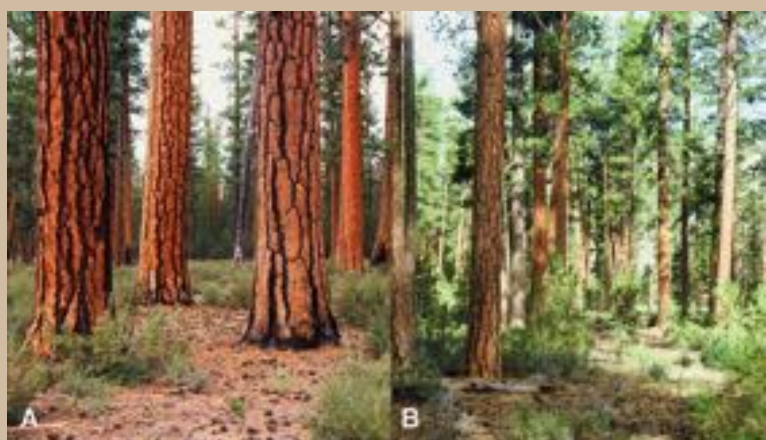
The image above showing a resilient ponderosa pine forest under a high frequency, low severity fire regime (A), and a less resilient system selectively logged for large diameter trees and under a low frequency, high severity fire regime (B).

This paper, published in the Journal of Forest Ecology & Management, explains how landscape ecology is simultaneously maintained by and influences the fire regime. In a review of historic landscape ecology in dry Northwestern forests, this paper highlights changes to vegetative communities post-settlement and how those changes will affect future management decisions. Looking back at historic communities, management decisions, and the resulting change in structure, the authors point to an uncertain future for restoration and management.